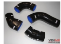
KIT Corrado G60 - Supercharger Hoses